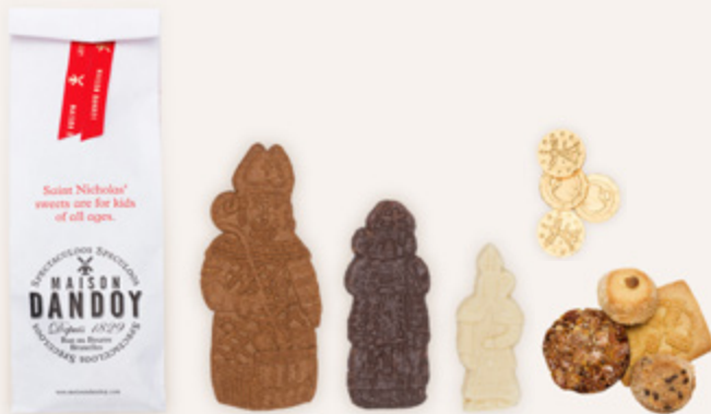
BIG PACKET 2