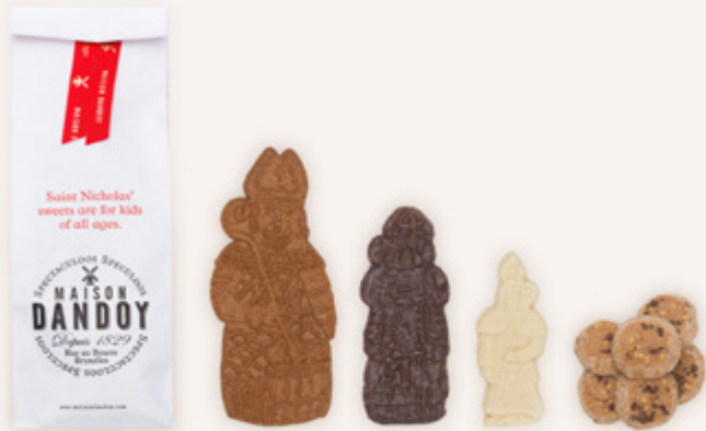
BIG PACKET 1

All our packets are made of food grade paper.