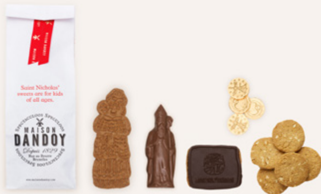
BIG PACKET 3